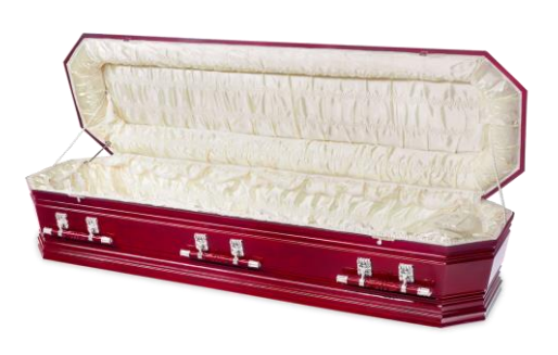
Grecian Rosewood Solid Plantation Pine