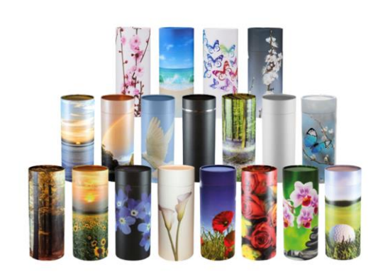
A wide variety of cardboard tubes to choose from