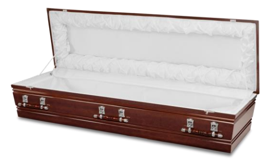
Devon Walnut Solid Plantation Pine