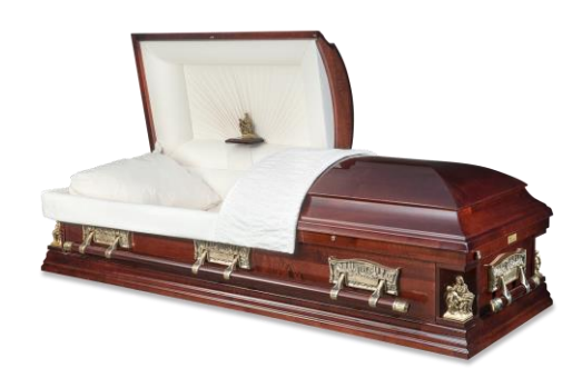
Di Vinci Solid Maple