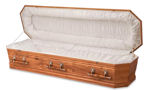
Grecian Blackwood Solid Tasmanian Blackwood